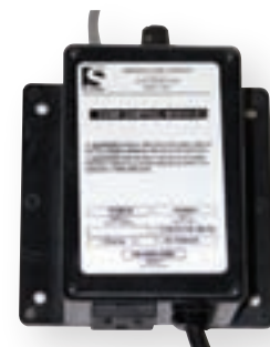
Pump Control Module