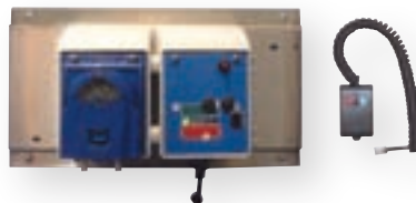
See page 61 for more laundry detergent dispensers.